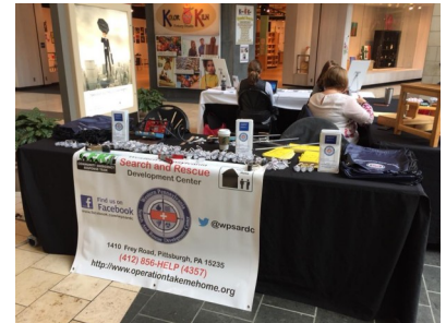
Camp, Care, Legal Resources Fair held by Autism Connection of PA at the Mall at Robinson 2018

Waivers: http://www.medicaidwaiver.org Family Resource Guide: http://familyresourceguide.org/medical-ins/medical-assistance.aspx